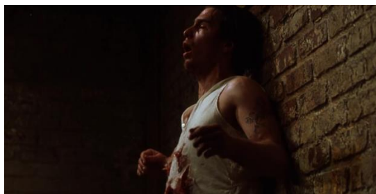
Figure 2: The Green Mile ( Duration 02.29.02-02.29.13 )

John punish Will Billy by killing him through Percy, he made Percy shoot Will Billy. The result of the resistance is feeling guilty but also relieved to have punished the murderer. The meaning to be conveyed from the picture is resistance behavior is also retaliation by taking action and showing it openly by the oppressed.